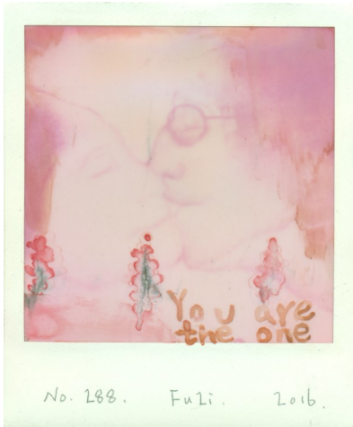
"No. 288", Fuzi, 2016