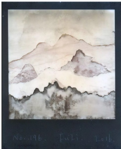
"No. 196", Fuzi, 2016