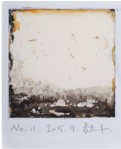
"No. 11", Fuzi, 2015