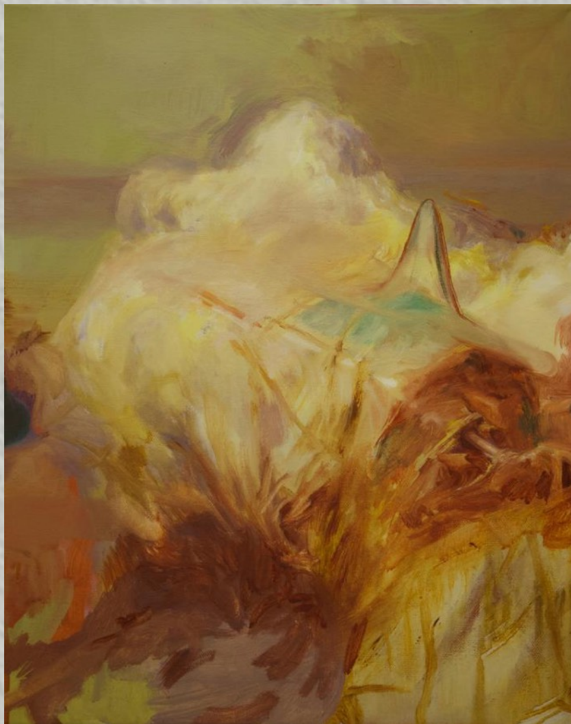
“ Emergency exit ”, Oil on canvas, 50cm x 40cm, 2022