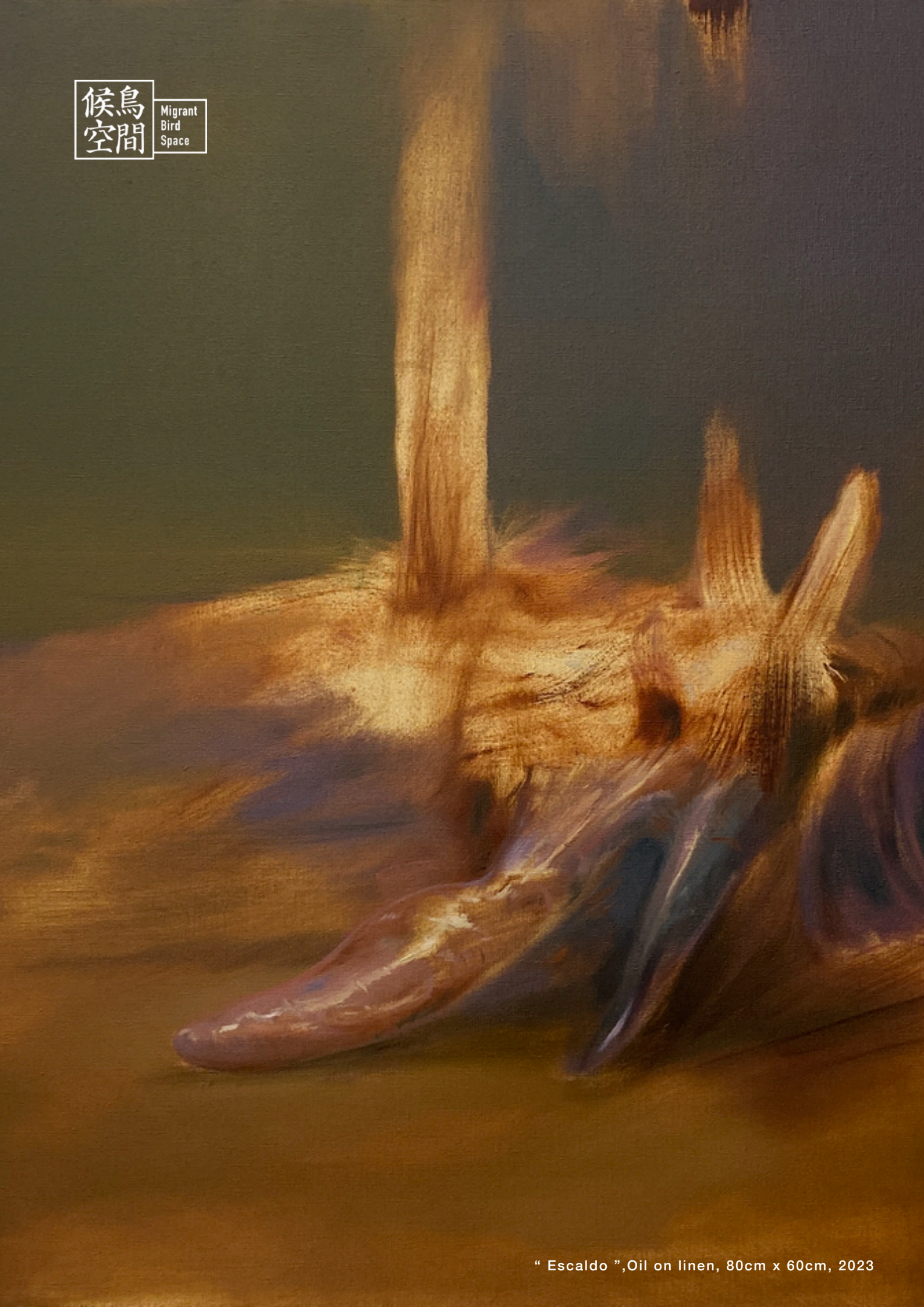
“ Escaldo ”, Oil on linen, 80cm x 60cm, 2023