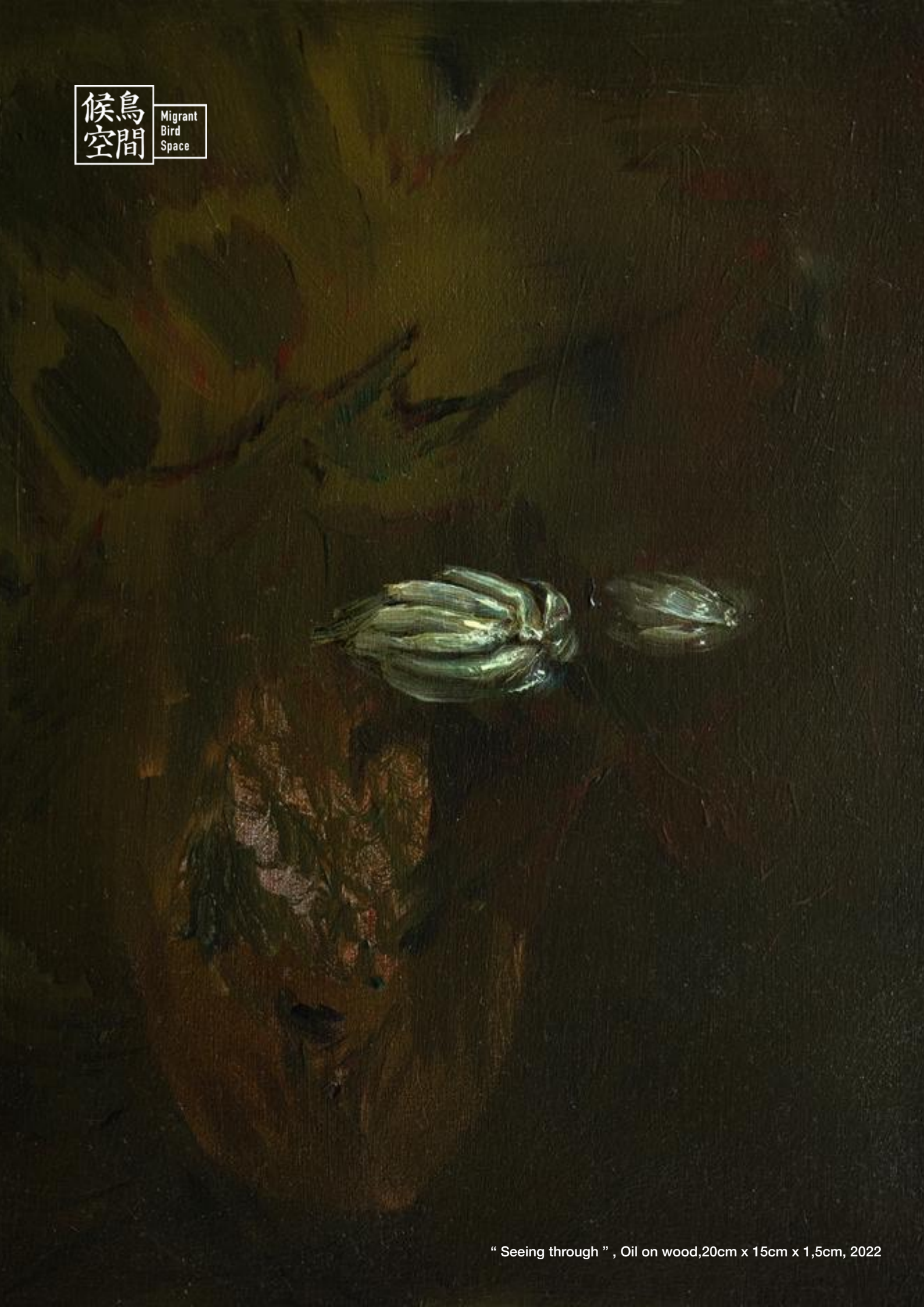
“ Seeing through ” , Oil on wood,20cm x 15cm x 1,5cm, 2022