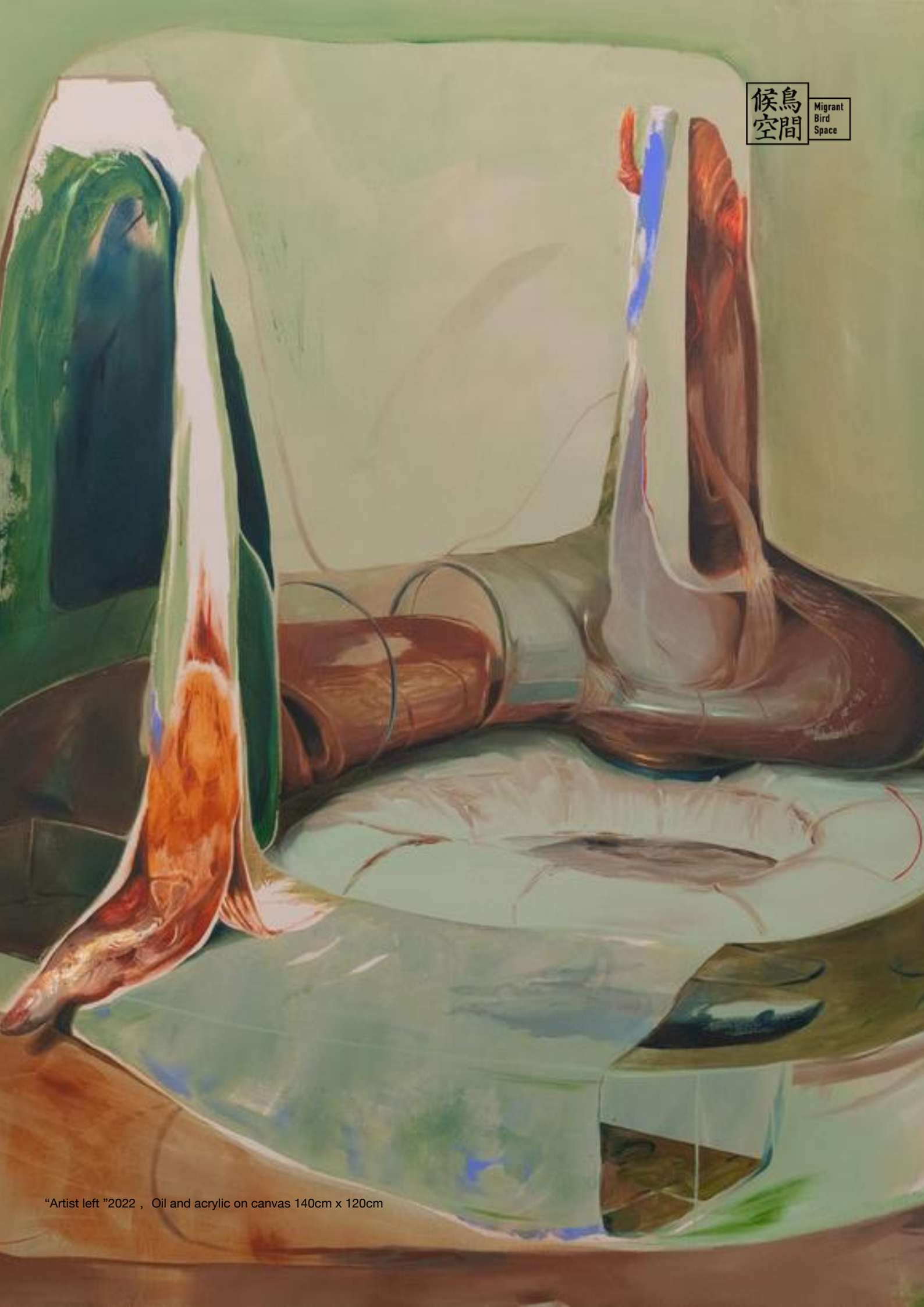
“Artist left ”2022 , Oil and acrylic on canvas 140cm x 120cm