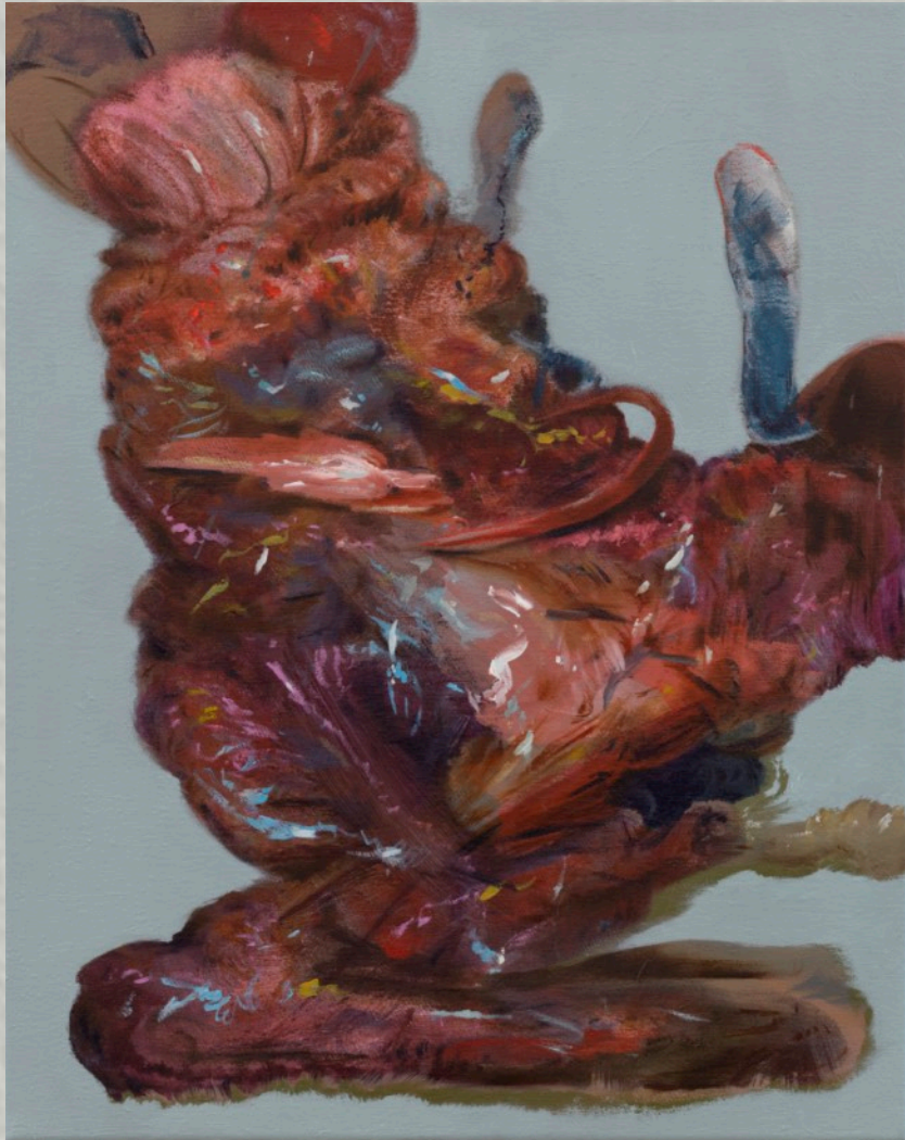
“Mirror” ,oil and acrylic on canvas ,50 x 40 cm ,2023